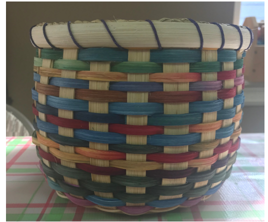
(Samples of baskets for class)

Cost: $20 per Canvas Painter/ Basket Other items for younger participants as well